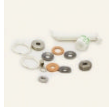
Probe Repair Kit