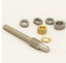
Bronze Valve Repair Kit