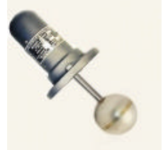
Replacement EA100 Ass'y