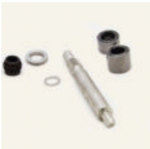
Steel Valve Repair Kit