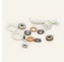
Probe Repair Kit