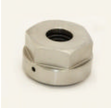
Simpliport Packing Nut