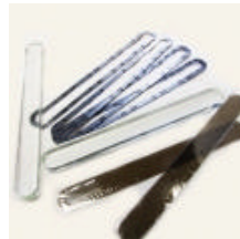
Gage Glass Repair Kit